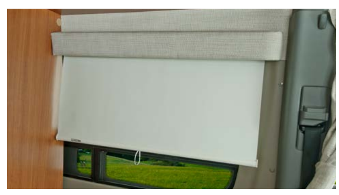
Day or night, the smooth-retracting MCD blackout roller shades give you total control of light and privacy levels.