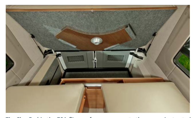
The Flex Bed in the 70A flips up for easy access to the convenient exterior storage compartment.