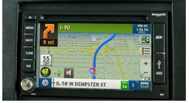
You'll appreciate the latest in-dash communications technology with the available Infotainment Center with Rand McNally RV GPS. It delivers safe and easy trip routing with turn-by-turn voice guidance, an AM/FM radio with a CD/DVD player, and available SiriusXM.™