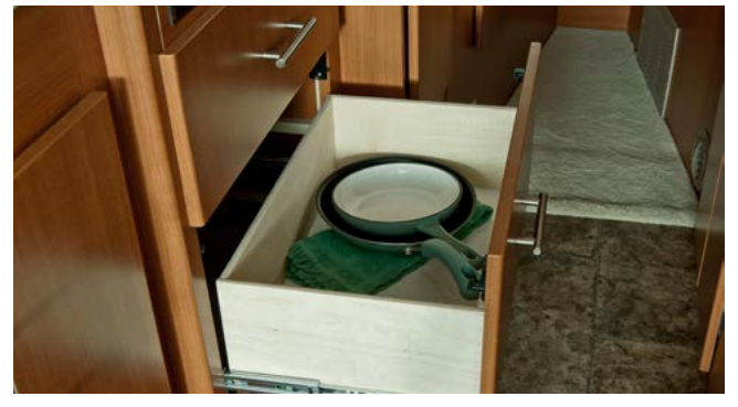
Drawers open wide with full-extension drawer slides.

Click on this icon throughout the brochure to link to more information on the web.