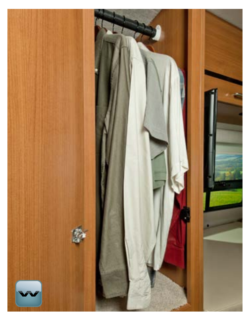
Both models include a surprising amount of storage, such as this wardrobe in the 70A.