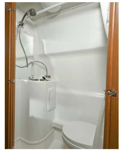
The bi-fold bathroom doors open wide for easy access, yet leave the aisle clear when open.