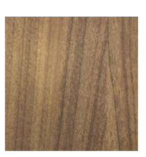
High-Gloss Marbella Cherry*

Winnebago Industries® reserves the right to change décor materials and specifications without notice or obligation.