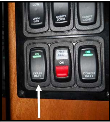
Figure 2 – Winnebago Industries Chassis Battery Disconnect Switch