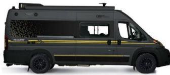
Option Code 33H – Granite

ProMaster Body Portion Granite Crystal – 86429K