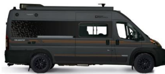
Option Code 33M – Granite

ProMaster Body Portion Granite Crystal – 86429K