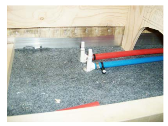
Hot and Cold Drain Petcocks