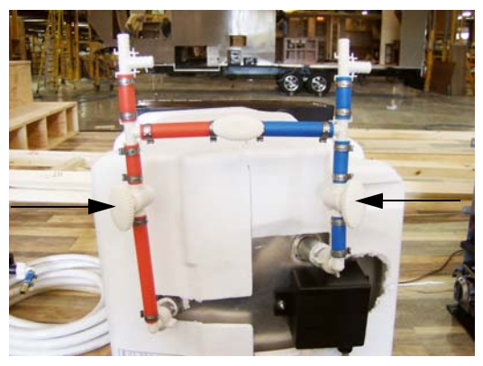
Water Heater Bypass Valves