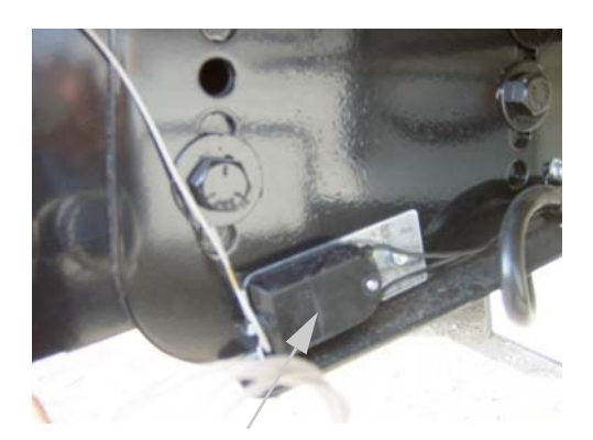
Break Away Device

Never tow a trailer without the trailer battery being hooked up and fully charged. Attach the breakaway lanyard cable so it is longer than the safety chain. When connected to the vehicle, the pull on the pin is in a straight line with the cable. Do not hook the cable over the trailer ball.