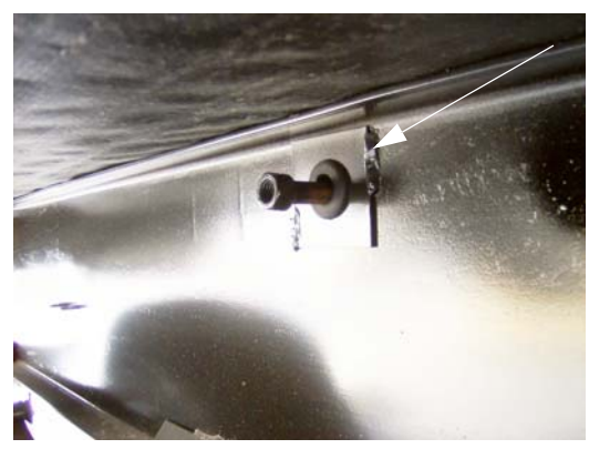
Manual Override, Requires a 3/4 inch wrench